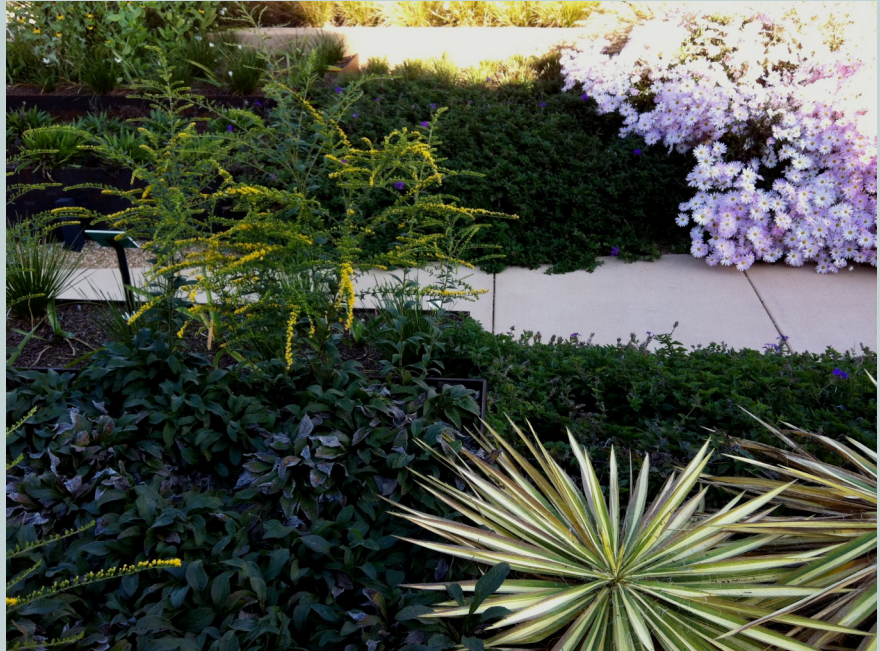
Native goldenrods, asters and verbenas provide late summer and fall color.

A plant schedule was created that list the various blooming times of the selected plants throughout the year.