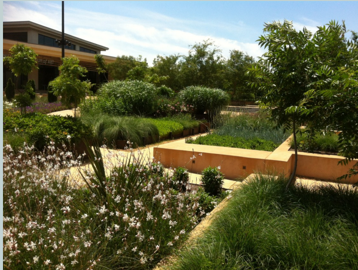
The Tray Gardens at The Art Garden