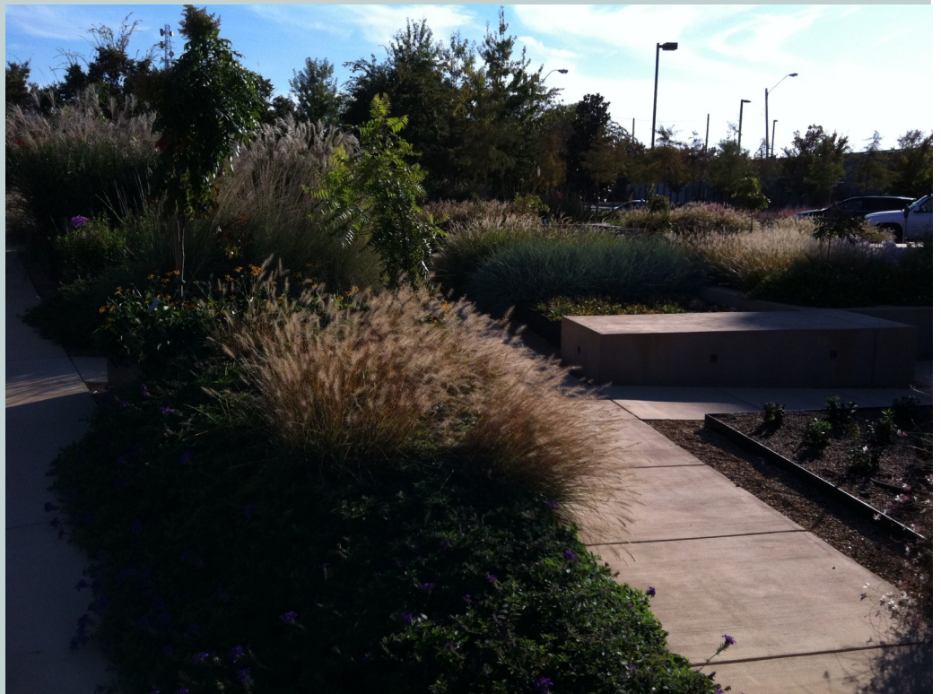
Grasses of varying heights separate spaces and provide winter interest.

Grasses are well-suited to hot, dry sunny conditions and have a variety of foliage colors. Their winter seedheads animate the landscape when they move in the wind and provide variety and intrigue.