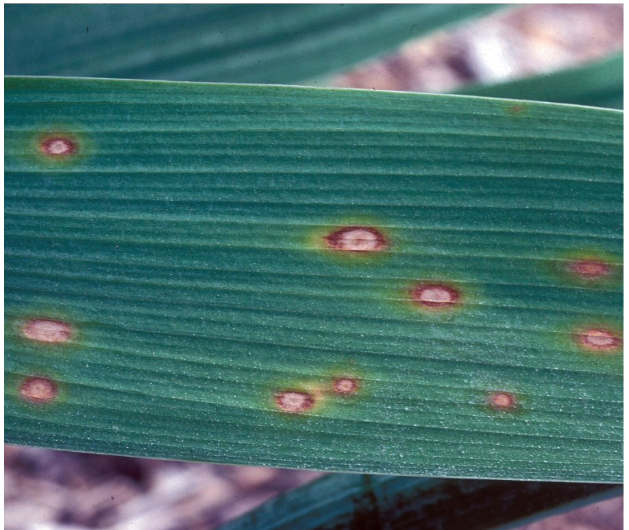
Iris leaf spot symptoms on an iris leaf.

Good cultural and sanitation practices will help to prevent leaf spot. It is important to remove and destroy the infected parts of the leaves as soon as the disease begins to develop. When removing diseased plant tissues, sanitize tools to prevent spreading the disease between plants. Collect and dispose of infected plant debris in the fall. If cultural practices fail to keep the disease in check, fungicide treatments have been reported to be effective.