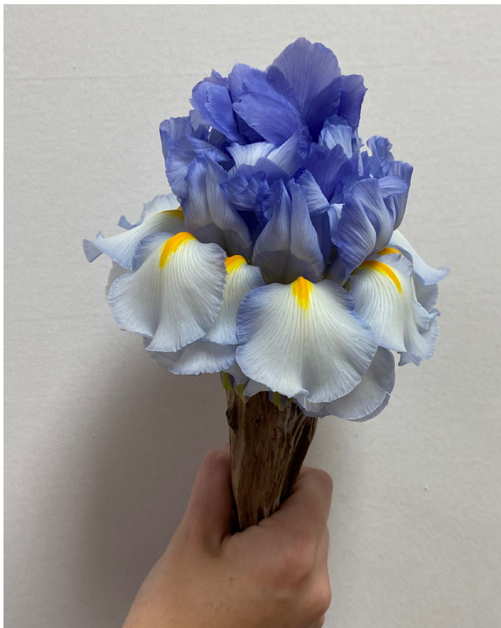
Completed Dutch iris composite flower.