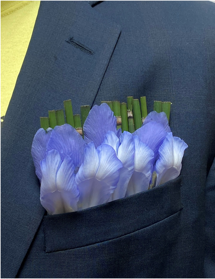
Pocket square example using standards and style arms.