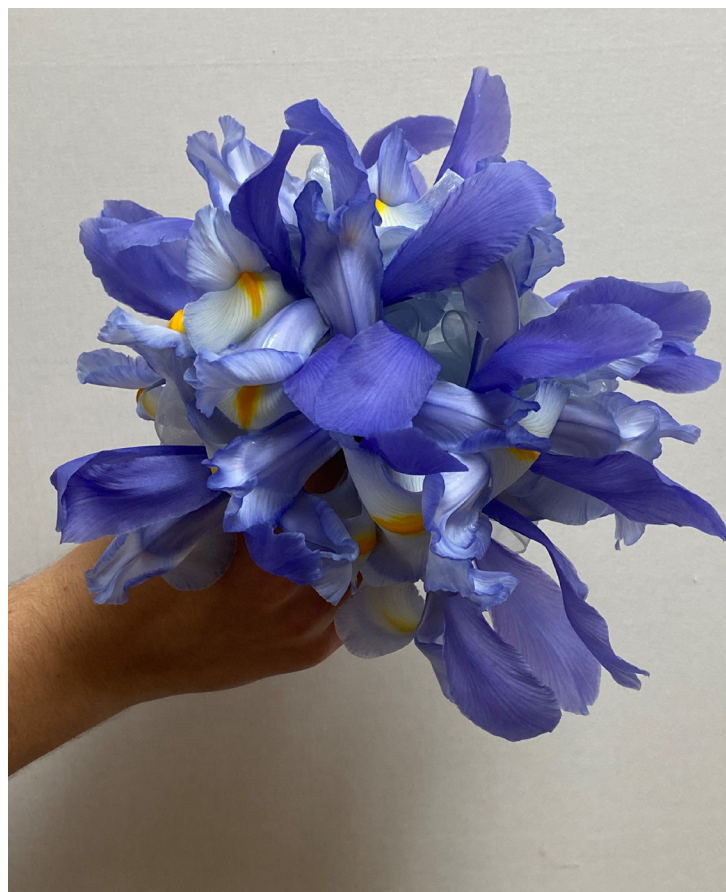
Dutch iris bridesmaid's nosegay.

This simple design has a spontaneous effect, and its design time is relatively quick. Once completed, thoroughly mist it with an anti-transpirant solution, allow the surfaces to dry, and package it in a plastic bag. Do not allow the plastic film to rest on the petals because this may allow gray mold to proliferate. Store the bagged bouquet in refrigeration. It can remain fresh for up to 3 days and still provide adequate display time for a wedding or event.