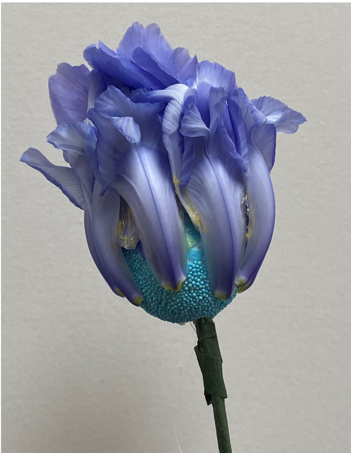
Dutch iris composite flower in process.