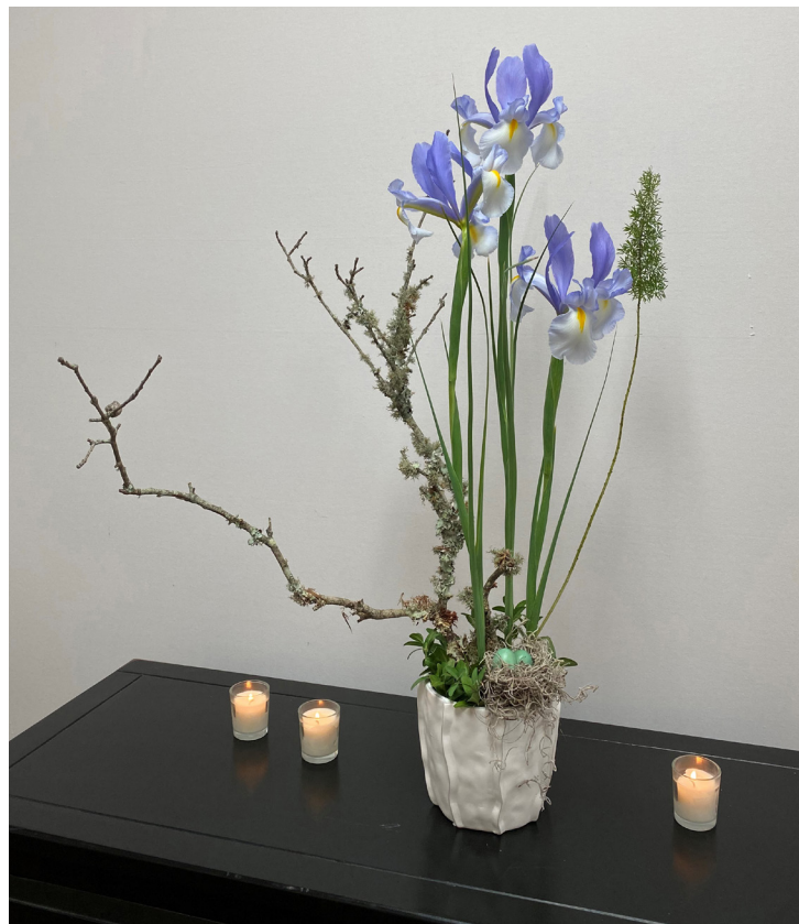
Asian-inspired table centerpiece.

We made a small nest of Spanish moss ( Tillandsia usenoides ) and anchored it into the floral foam using 20-gauge wire pins. A few artificial robin eggs complete the design's base. Three votive candles suggest this combination as a table centerpiece suitable for an after-6-o'clock event.