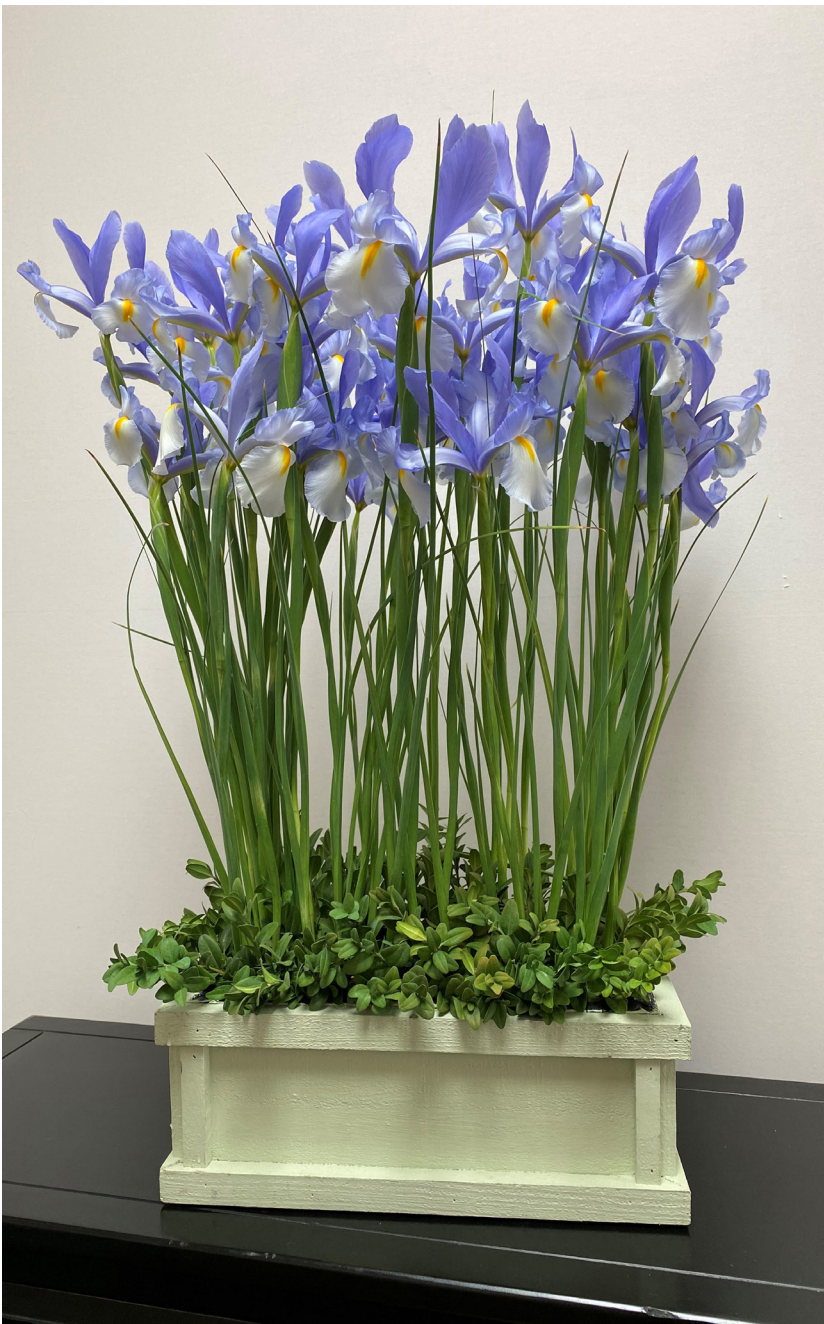
Dutch irises arranged in a wooden planter box.

Iris flowers are not sensitive to ethylene, a naturally occurring plant hormone that ages cut flowers. No special steps are needed (ethylene scrubbers or separate storage areas) to prevent ethylene damage. Commercially grown irises are sold in 10-stem bunches and are packed into cardboard boxes and shipped. Their vase life may be shorter than other cut flowers, between 2 and 5 days; however, floral food can extend the vase life to a week.