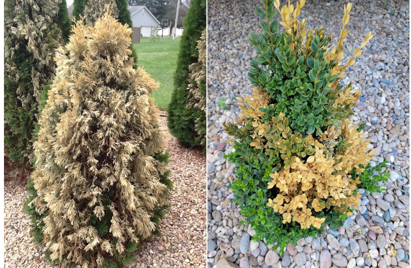
(Left) Typical winter desiccation injury on arborvitae. (Right) Boxwoods are also prone to winter desiccation injury.

One of the major causes of winter damage is lack of adequate soil moisture. Dry soil coupled with strong winter winds can cause severe problems for your plants. While the need for watering during the heat of the summer is obvious, it may not be quite as apparent during the winter. Remember your plants are still alive and need water. You can test the soil moisture using your finger, a garden trowel, moisture meter, or screwdriver. This can help you determine if you have adequate moisture for winter protection.