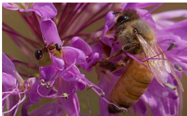
Argentine Ants May Transfer DWV to Honey Bees