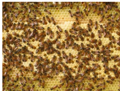
The perfect capitalists: industrious, efficient, and single-minded in their pursuit of success.

"It's not the honey bees that are in danger of going extinct," Kaplan wrote in an email, "it is the beekeepers providing pollination services because of the growing economic and management pressures. The alternative is that pollination contracts per colony have to continue to climb to