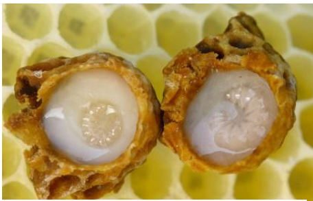
Queen larvae floating in Royal Jelly

What's the News: It's long been known that a female bee's place in the social order—whether she becomes a worker or a queen—depends not on her genes, but on whether she eats royal jelly. A study published in Nature found that royalactin, a protein found in royal jelly, is responsible for many of the physical differences that distinguish queens from the hoi polloi of the hive—and, surprisingly, that royalactin can even cause fruit flies to develop queen bee-like traits. This finding also shines light on how, at a cellular level, royal jelly turns bees into queens.